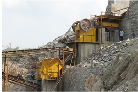
Stone Production Line