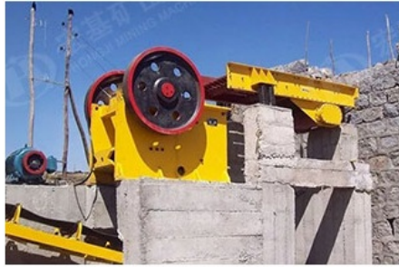
Sand Production Line